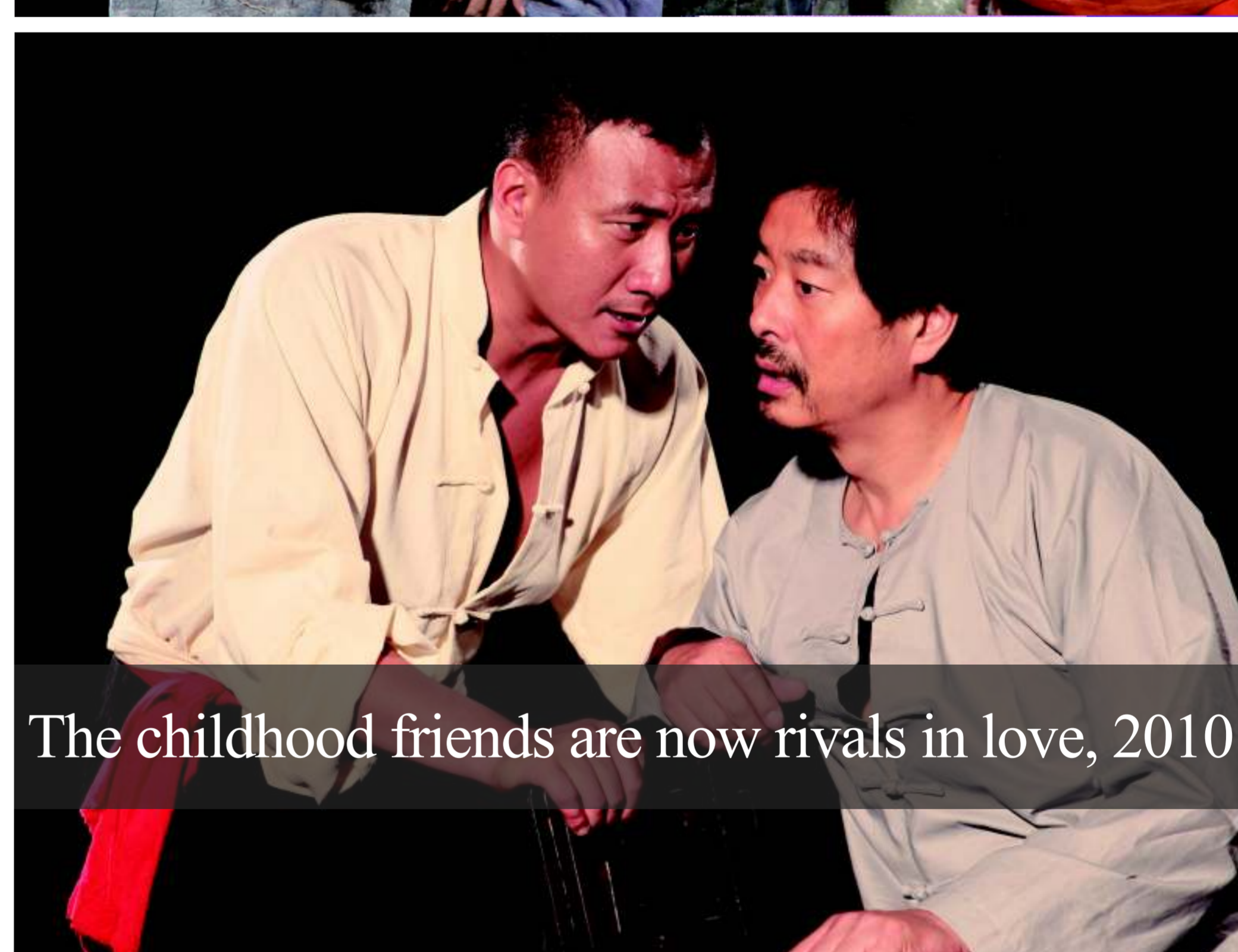
The childhood friends are now rivals in love, 2010