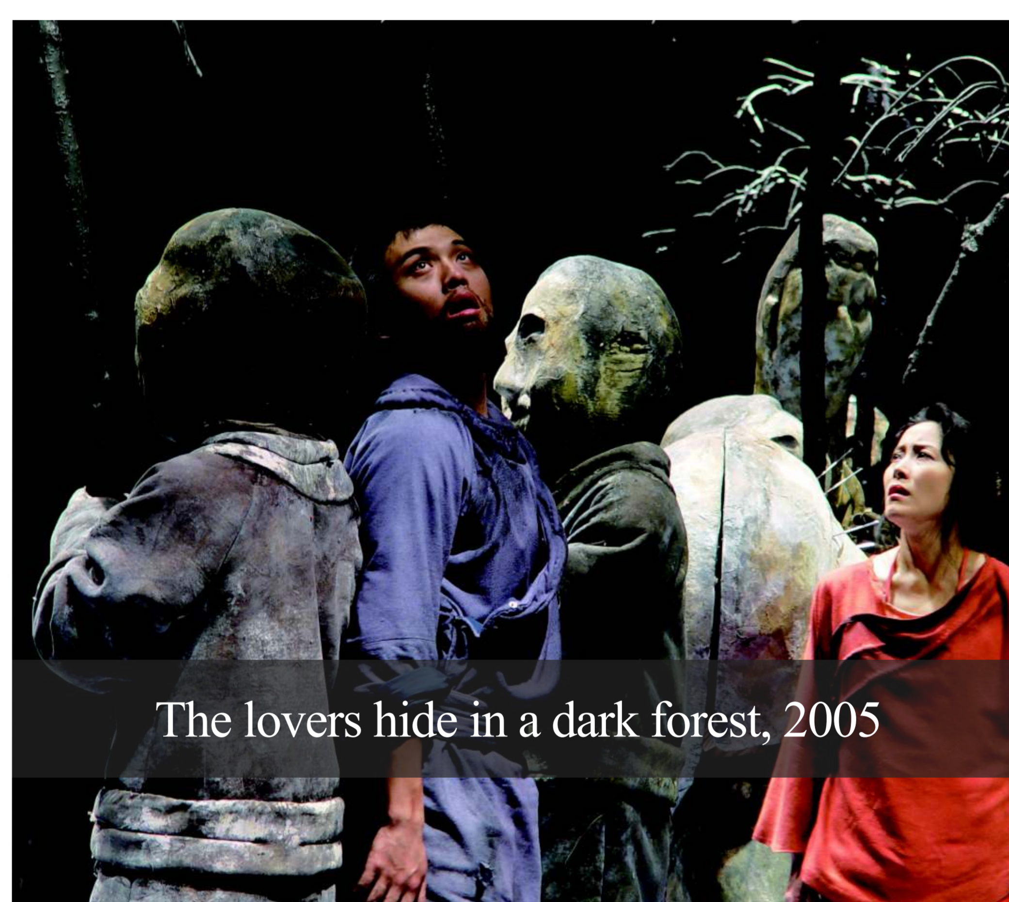
The lovers hide in a dark forest, 2005