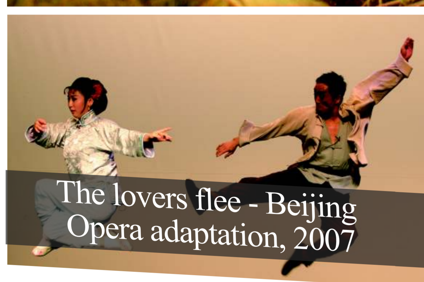
The lovers flee - Beijing Opera adaptation, 2007