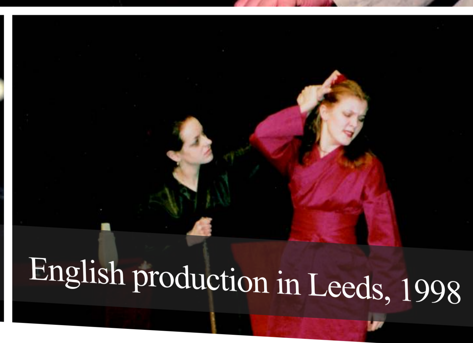
English production in Leeds, 1998