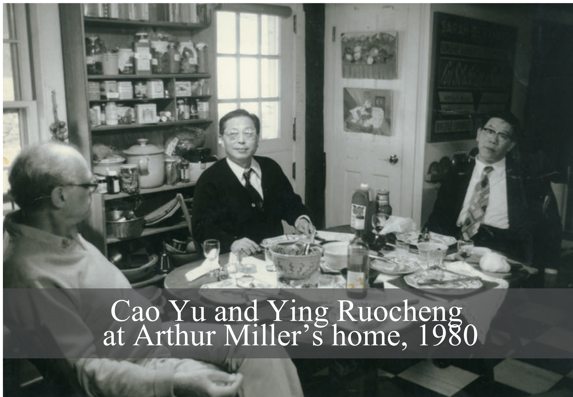
Cao Yu and Ying Ruocheng at Arthur Miller's home, 1980