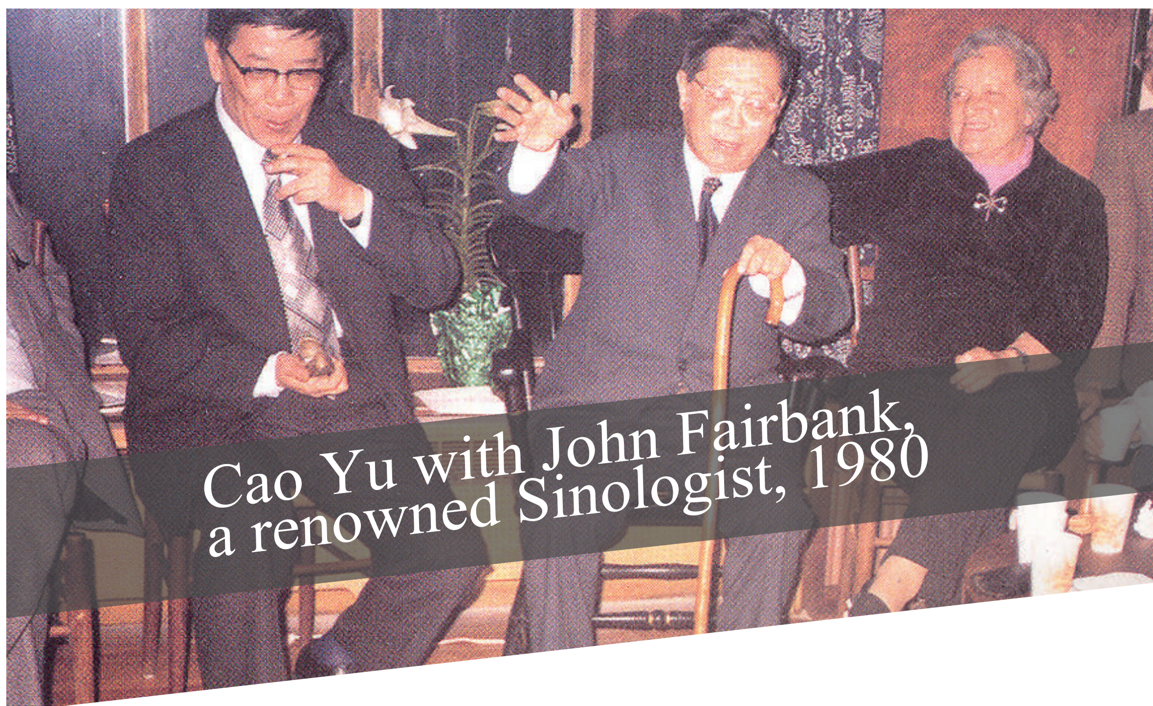
Cao Yu with John Fairbank, a renowned Sinologist, 1980