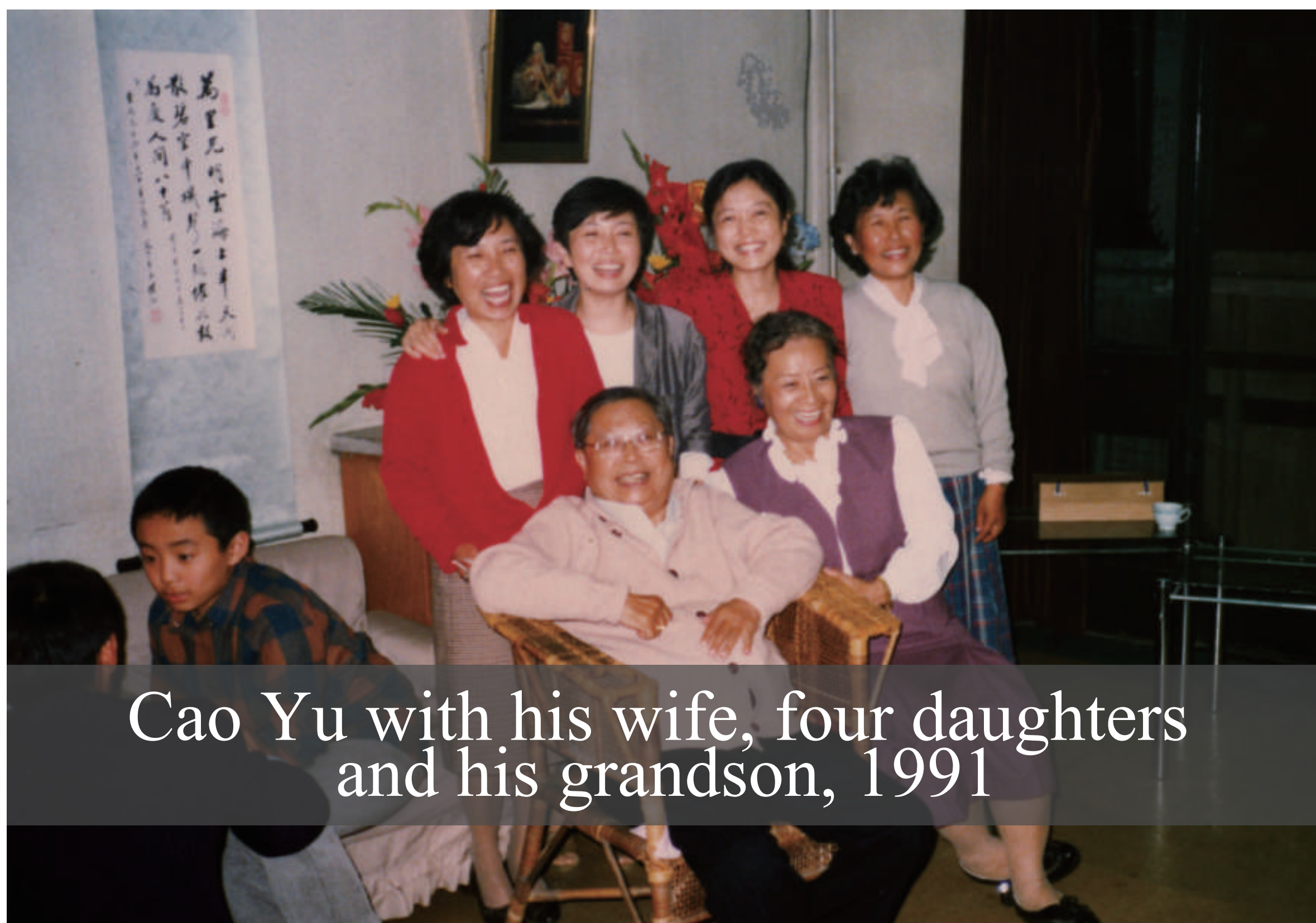
Cao Yu with his wife, four daughters and his grandson, 1991