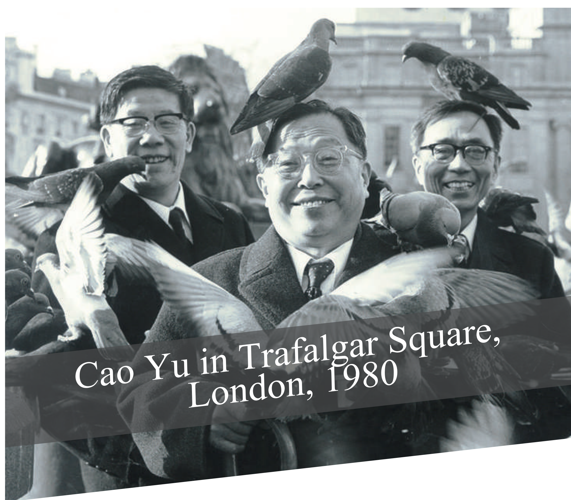
Cao Yu in Trafalgar Square, London, 1980