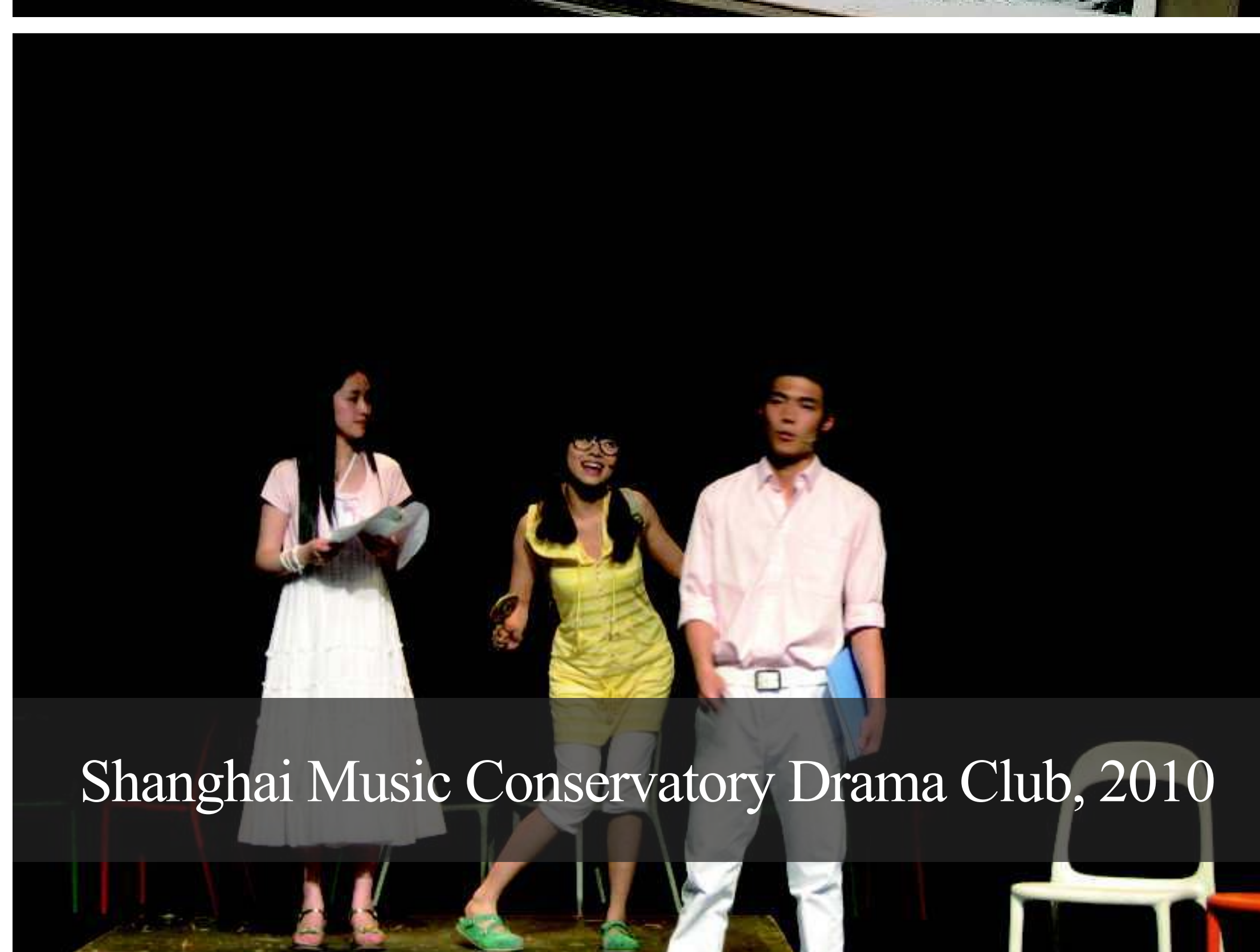
Shanghai Music Conservatory Drama Club, 2010