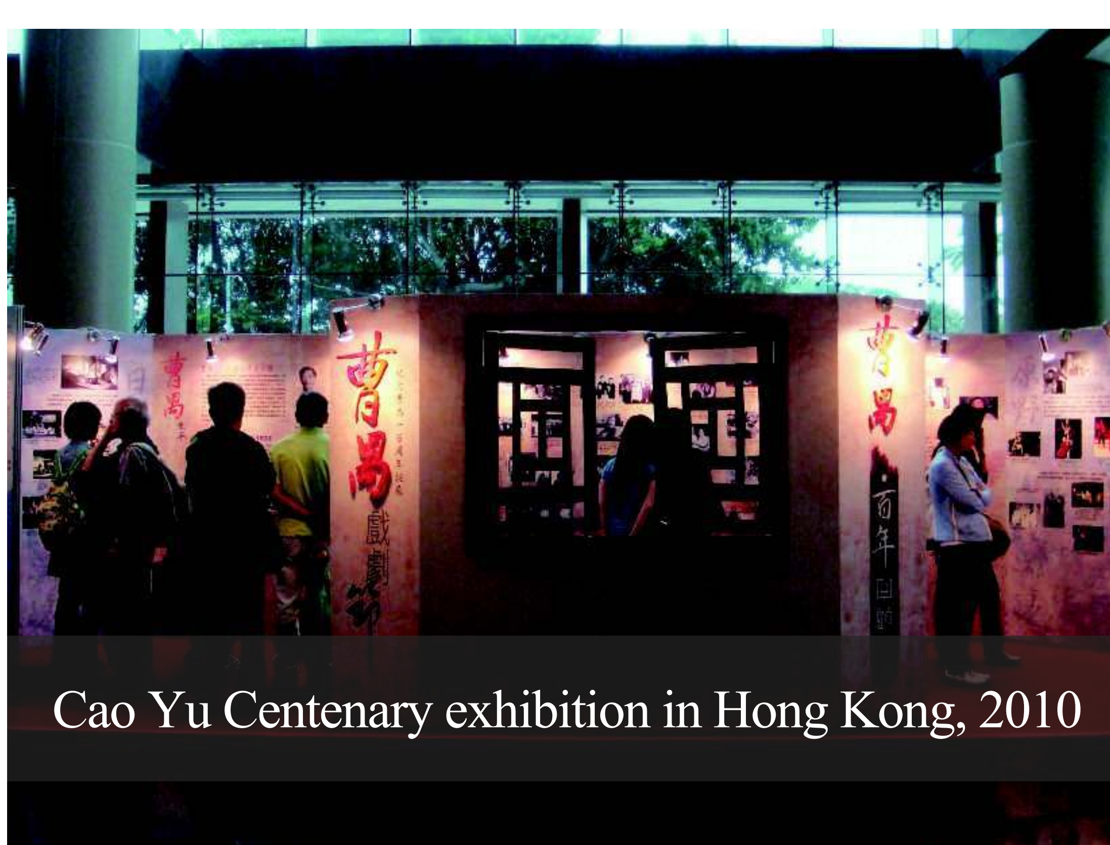
Cao Yu Centenary exhibition in Hong Kong, 2010