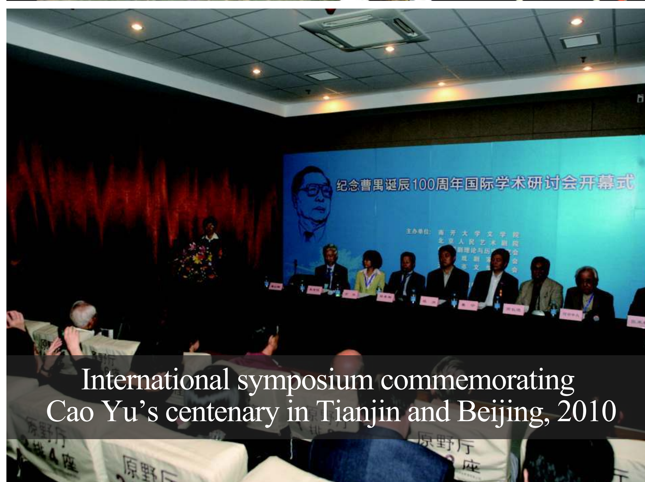
International symposium commemorating Cao Yu's centenary in Tianjin and Beijing, 2010