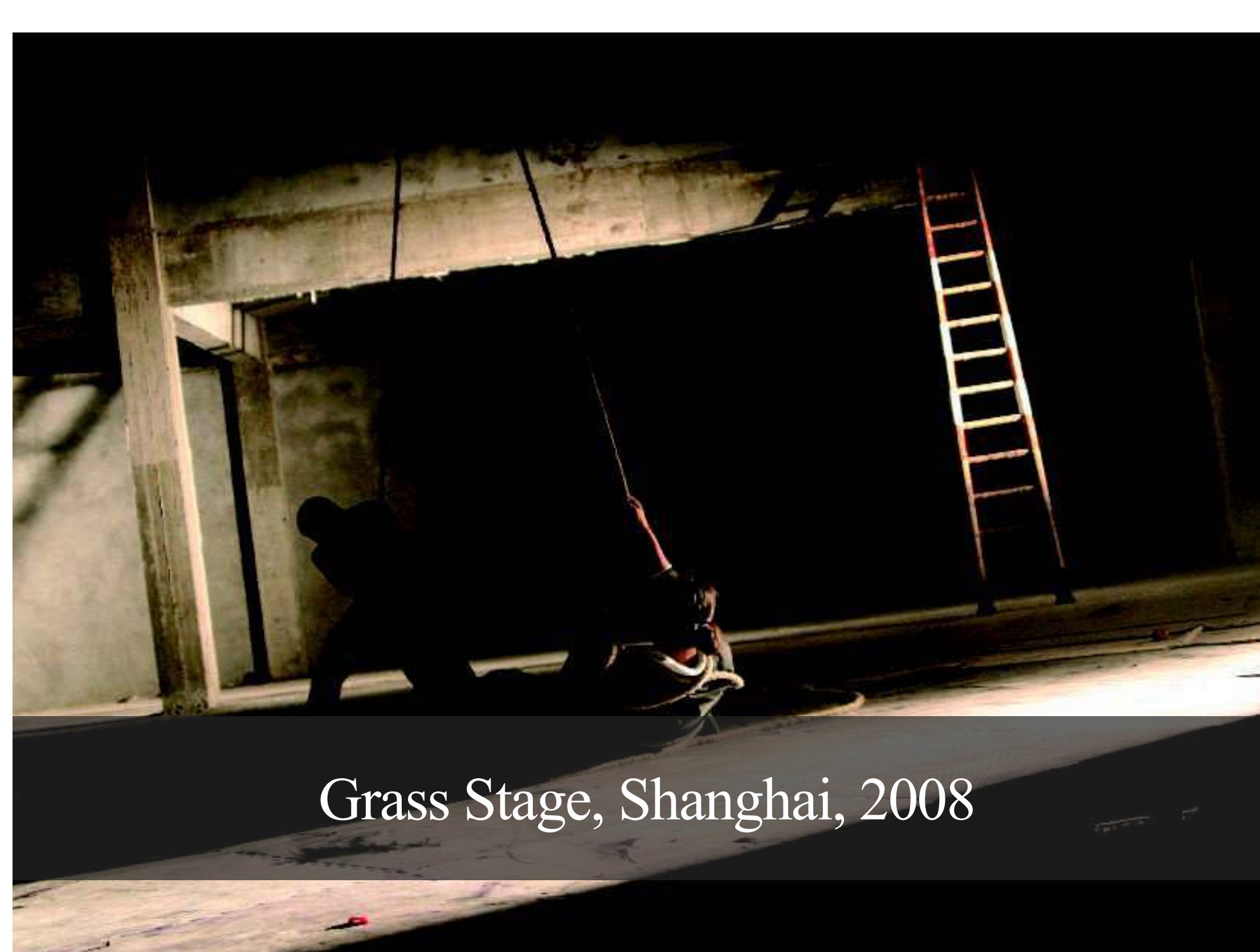
Grass Stage, Shanghai, 2008

Through the work of Cao Yu, and fellow pioneers, an unfamiliar imported theatrical genre finally flowered into the Chinese spoken drama which today enjoys an enthusiastic following among Chinese theatre practitioners and younger audiences.