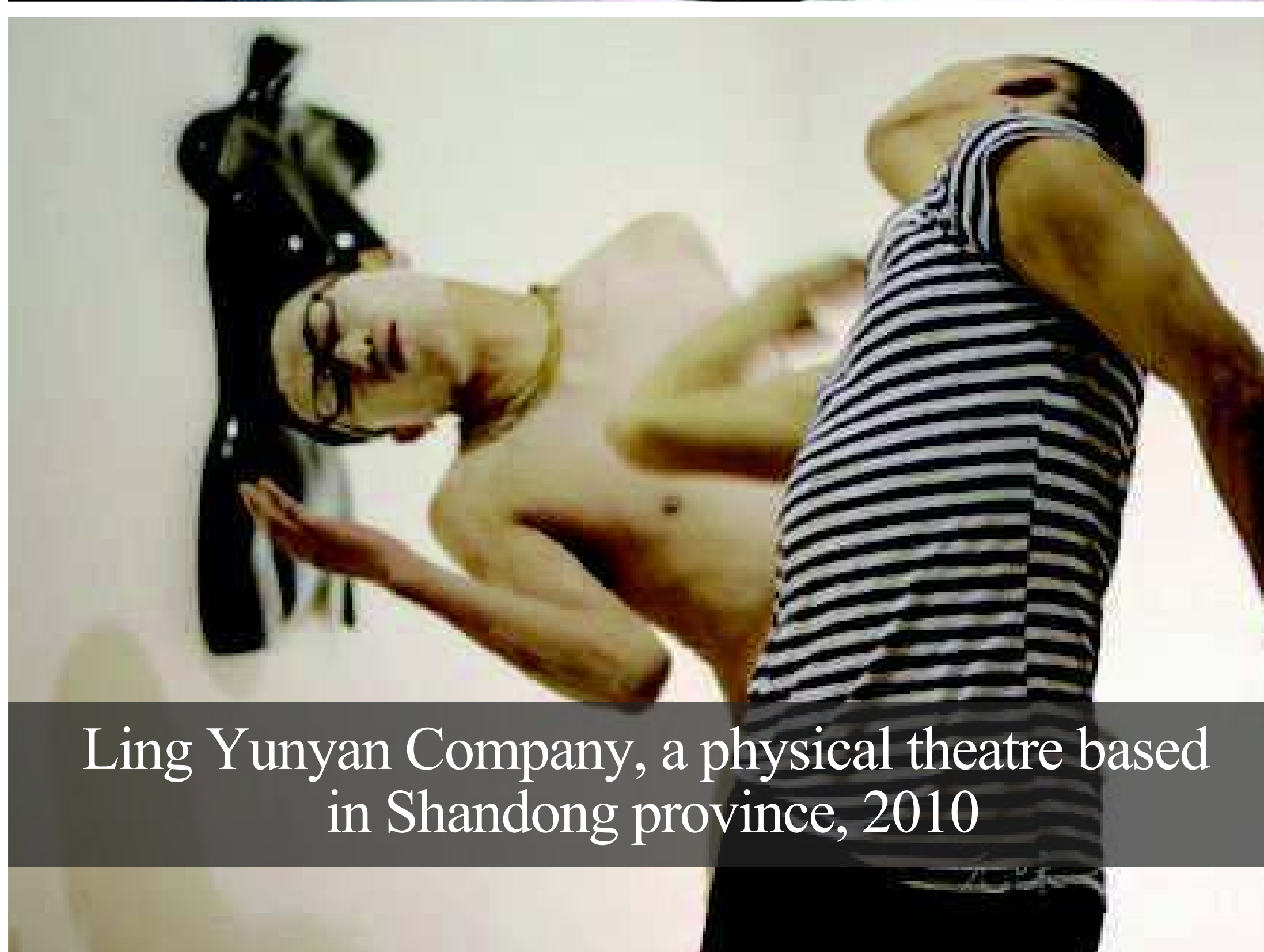
Ling Yunyan Company, a physical theatre based in Shandong province, 2010