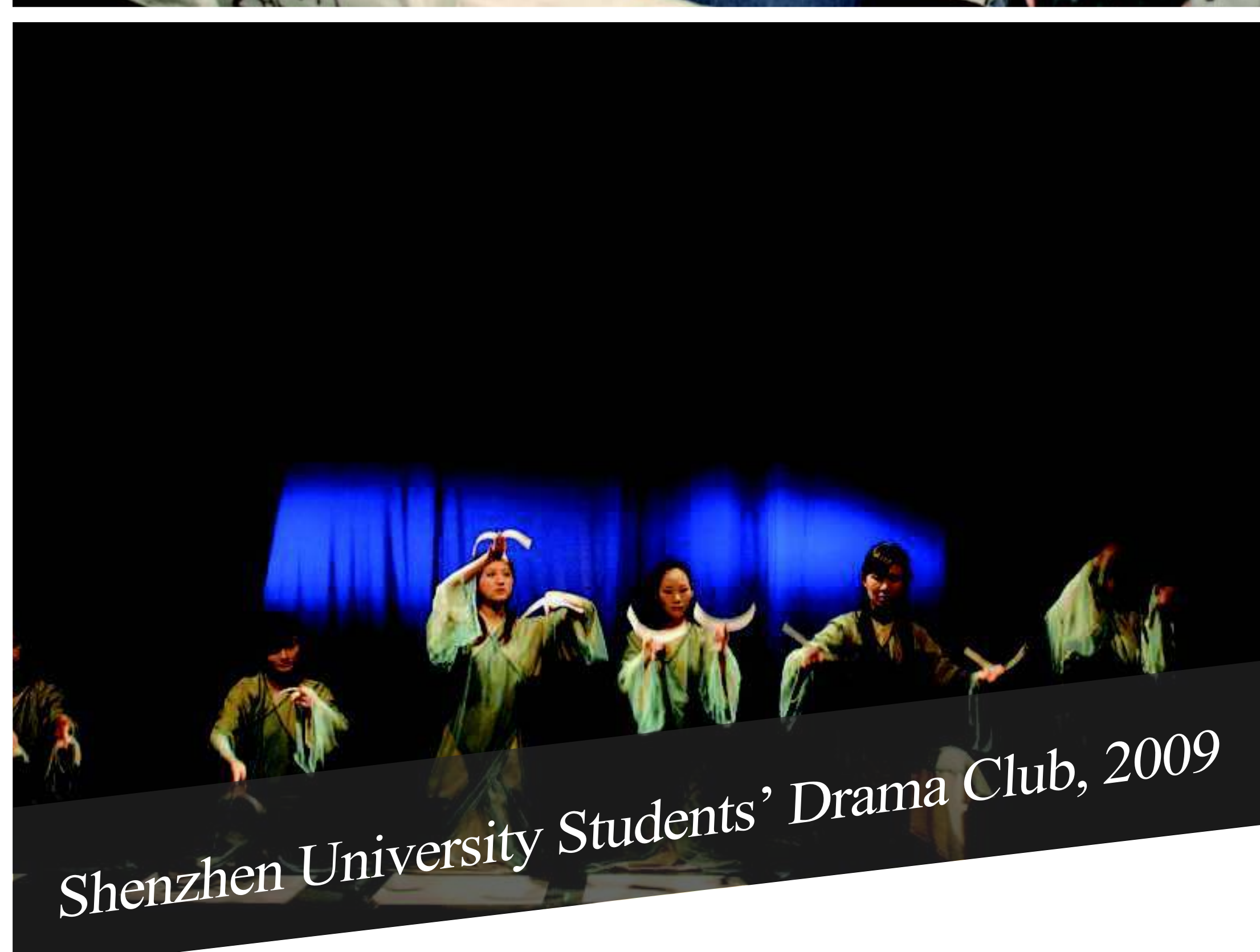
Shenzhen University Students' Drama Club, 2009