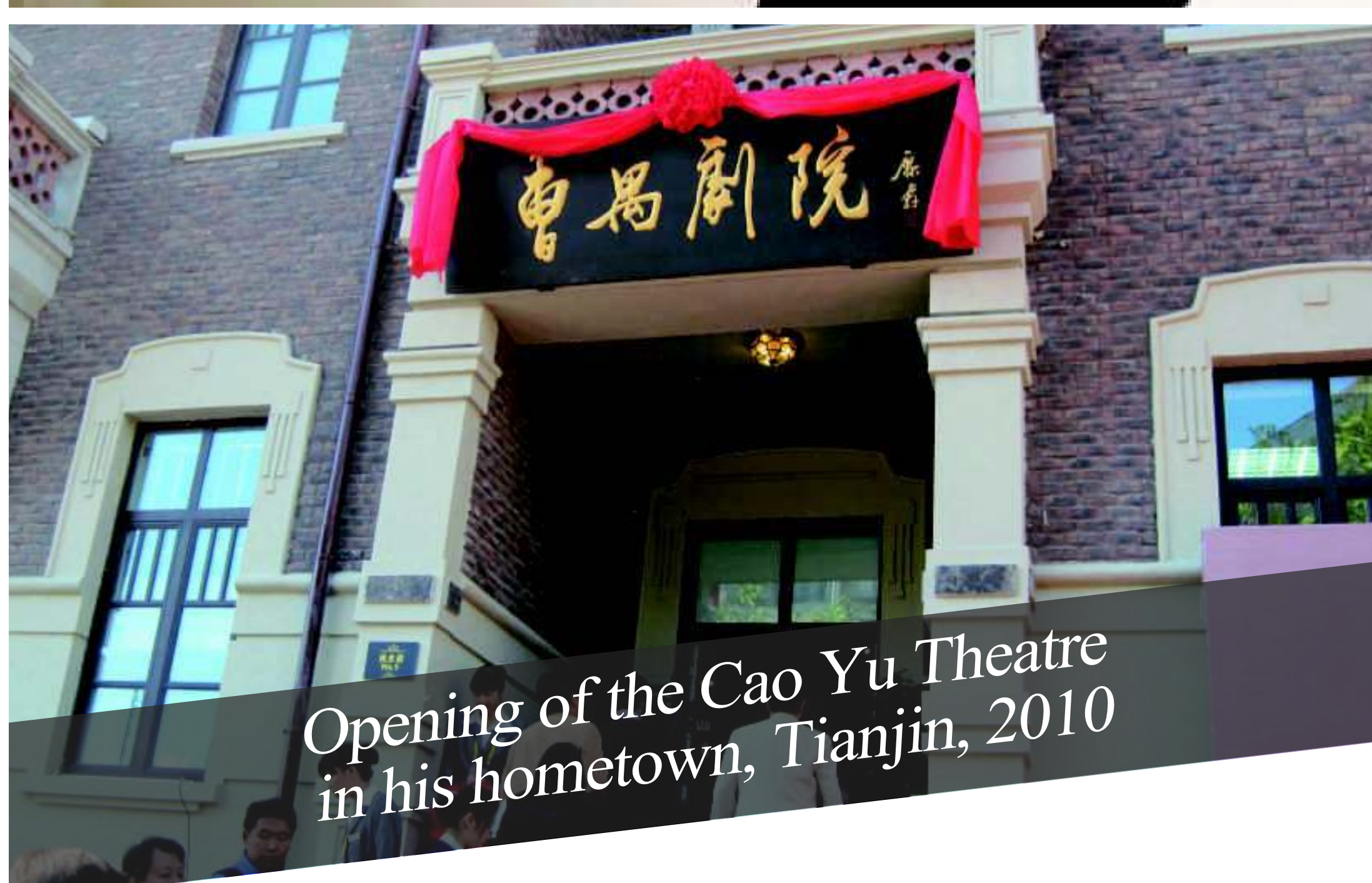
Opening of the Cao Yu Theatre in his hometown, Tianjin, 2010