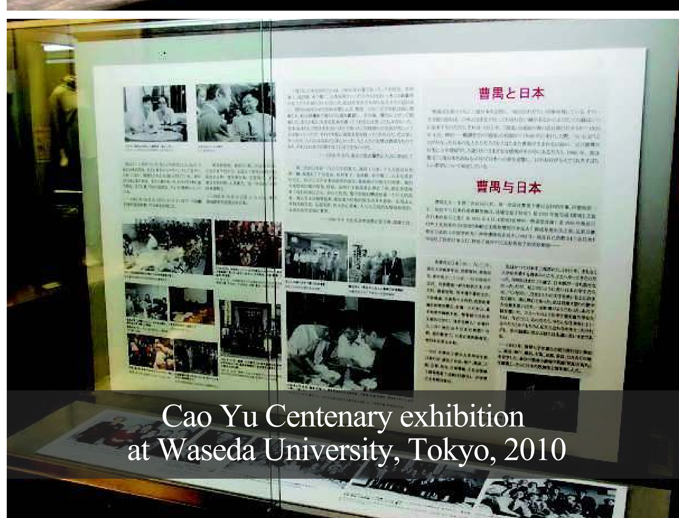
Cao Yu Centenary exhibition at Waseda University, Tokyo, 2010